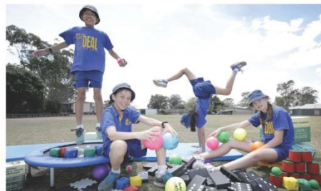
School captains and vice-captains test the new equipment.

Bardia Public School is the recipient of thousands of dollars' worth of new sports equipment, thanks to the generosity of Dahua. Balls, mini basketball hoops, a mini trampoline, balance beams, gym mats, jumbo outdoor games and a variety of other equipment have been purchased with the funds to teach students fundamental movement skills. Keeping children active is a vital part of their wellbeing.