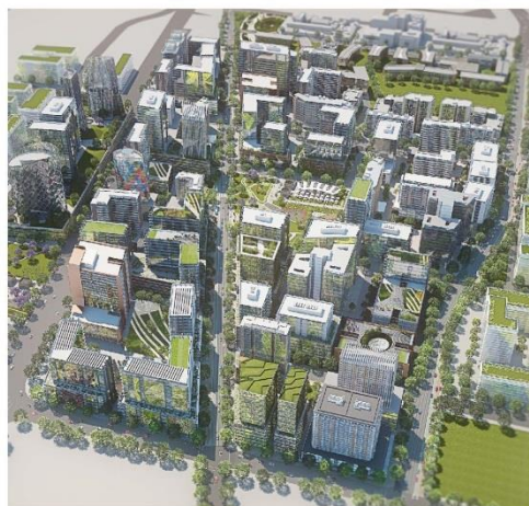
Australia's greenest city vision.

https://www.campbelltown.nsw.gov.au/Business/ReimaginingCampbelltown