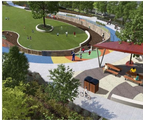
Artist impression - a bird's eye view of Ingleburn Park.

Recreational pursuits such as soccer, rugby, cricket, frisbee throwing and picnics will be enjoyed in the open spaces. Ingleburn Park also plays an important part in the 'green network' at New Breeze, connecting pedestrians and cyclists with the sports precinct to the east and Ingleburn Park to the west.