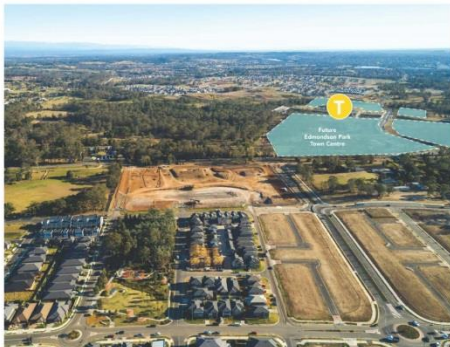
New Breeze continues to expand.

Land lot sizes are from 200 sqm with prices starting at $350,000. All of the lots include NBN access and are positioned within walking distance to Ingleburn Park and the Northern Corridor.