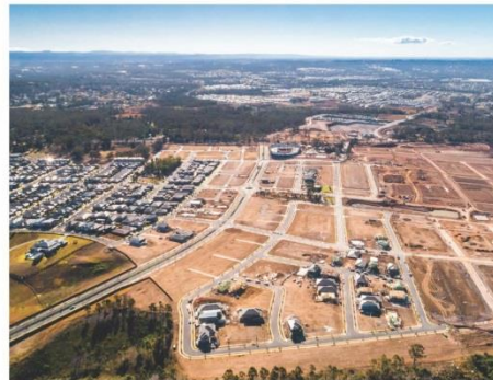
Homes rise up at New Breeze.

Construction has started on the first homes in New Breeze with about 30 now rising up. The first residents are expected to move in by the end of this year. Billions of dollars by federal and state governments, as well as the private sector are being injected into the area which is also creating thousands of jobs. New Breeze is strategically placed in the middle of this burgeoning activity.