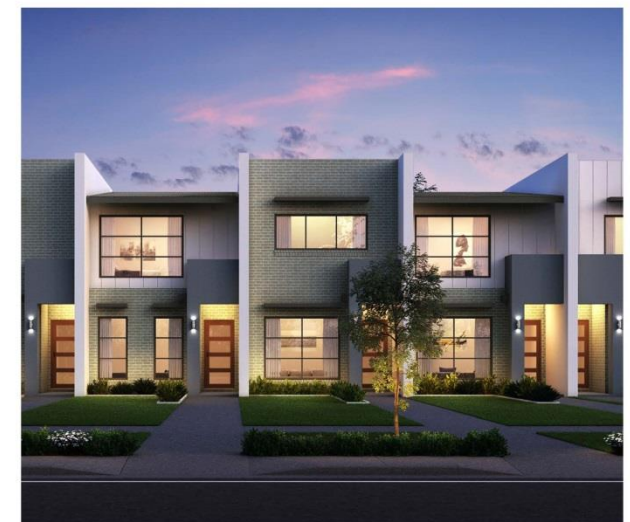
Two and four bed multi-storey designs are available.

Two and four bed multi-storey homes designs are available. The stunning homes boast light and spacious living areas with excellent solar access, functional living spaces and private backyards, a lock-up garage and gourmet kitchen with Caesar stone benchtops and stainless-steel appliances.