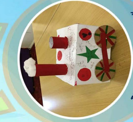
The Train Donation Box