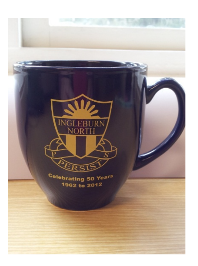
COMMEMORATIVE MUGS $5 each from the Office, they will make a lovely stocking filler.

COMMEMORATIVE PAVERS $30 each you can select your own Printing, Name, class, year. Order forms at the office.