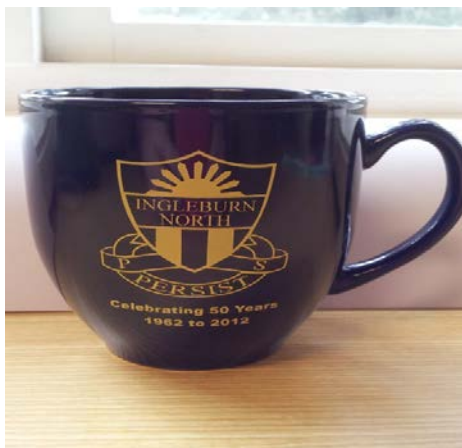
Commemorative Mugs $5.00 each. On sale from the office.