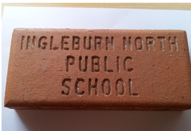
Commemorative Pavers $30.00 can be ordered from the office. You can select your own printing, student names, year of attendance, captains or family names.